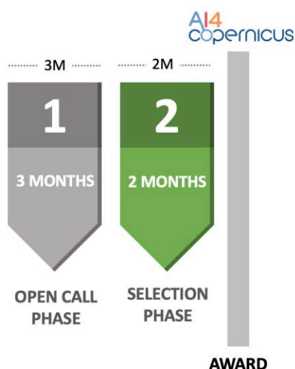
Figure 2: Open Call Phases for Individuals