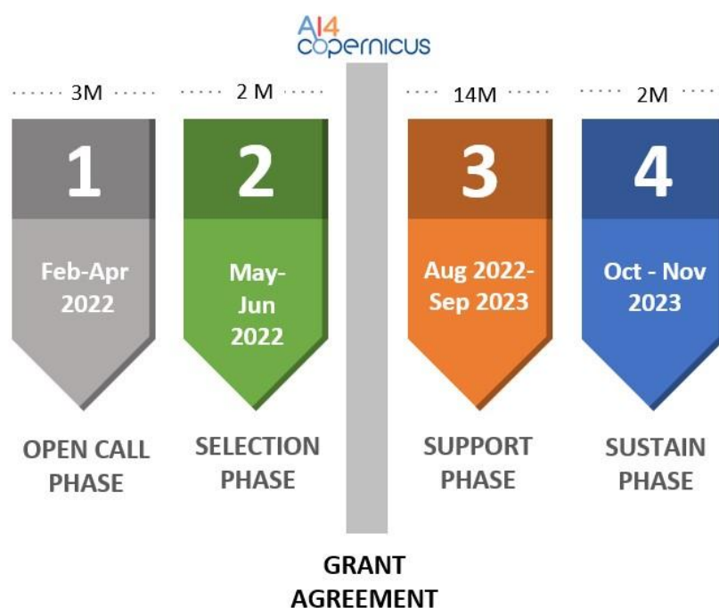
Figure 1: 4 th Round of Open Call Phases for SMEs

During this period the following services, will be provided: