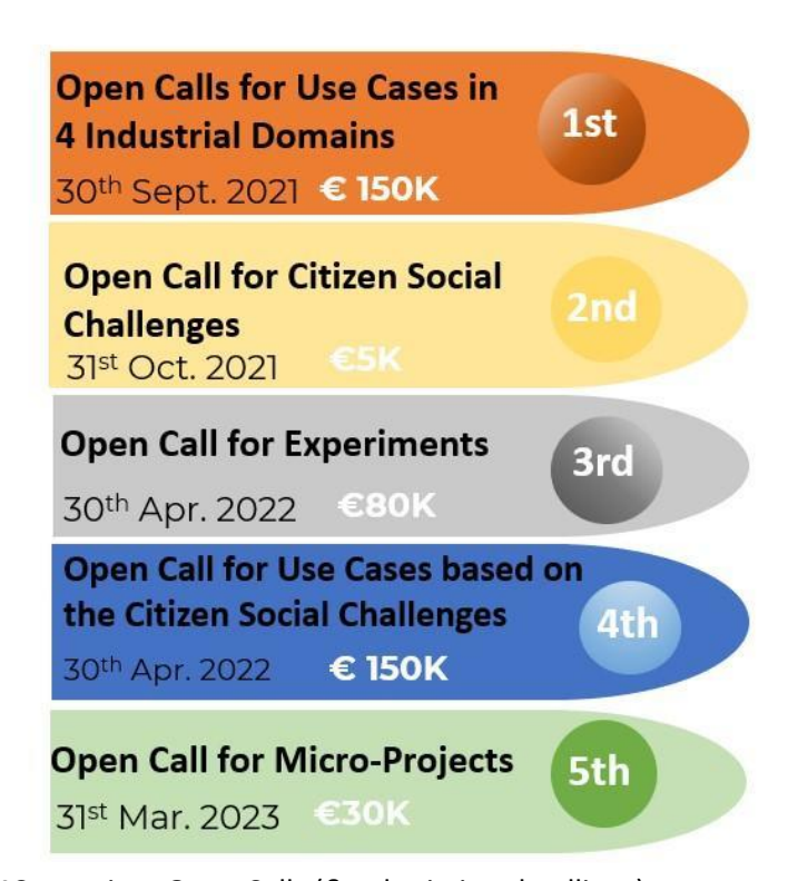
Figure 2: The 5 Rounds of the AI4Copernicus Open Calls (& submission deadlines)

30. I am an individual entrepreneur. Am I eligible for the 5<sup>th</sup> Round of Open Calls for micro-projects?