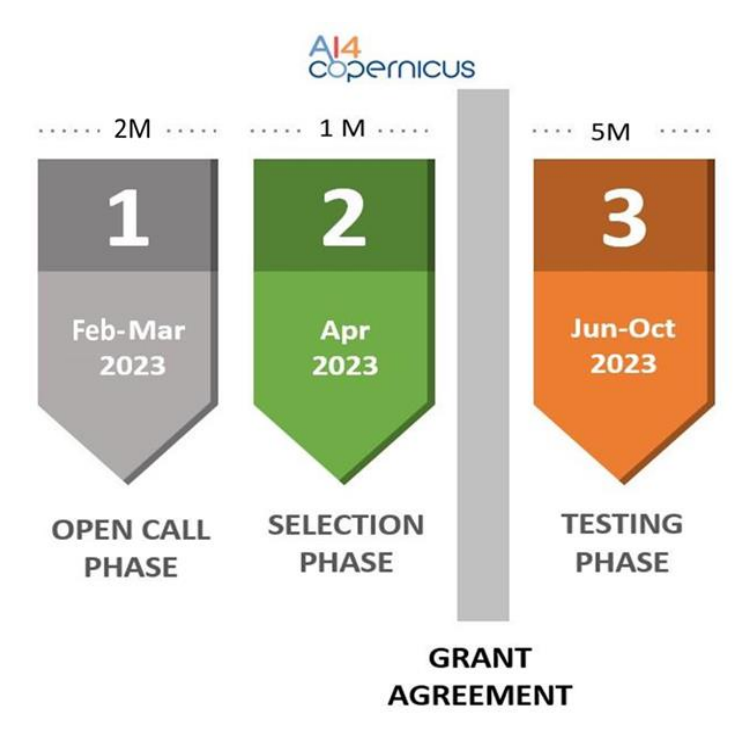
Figure 1: 5<sup>th</sup> Round of Open Call Phases for SMEs

The 5<sup>th</sup> Round of Open Calls involves a single "testing" phase of the AI4Copernicus Project services, as well as three sub-phases, as shown in the following figure: